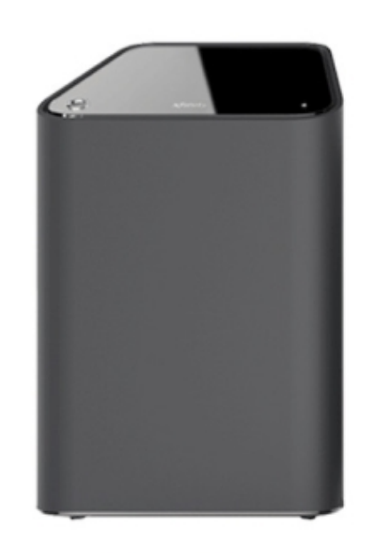
xFi Advanced Gateway