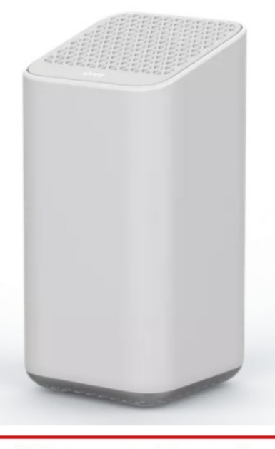
xFi Gateway 3rd Generation